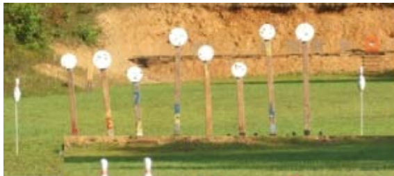
Rimfire/Centerfire Offhand Rifle steel plate/bowling pin September 5, 2015